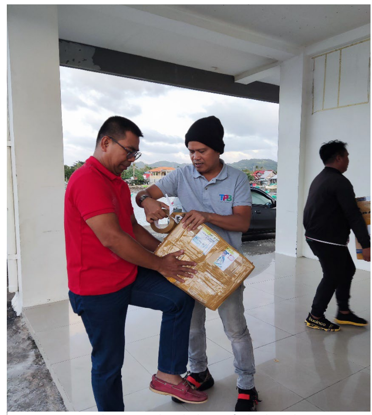
CSR volunteers sealing the boxes of school supplies