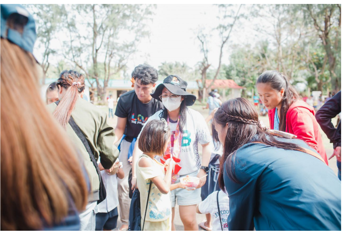
Some of the CSR volunteers serving the soup kitchen to the kids after receiving the school supplies