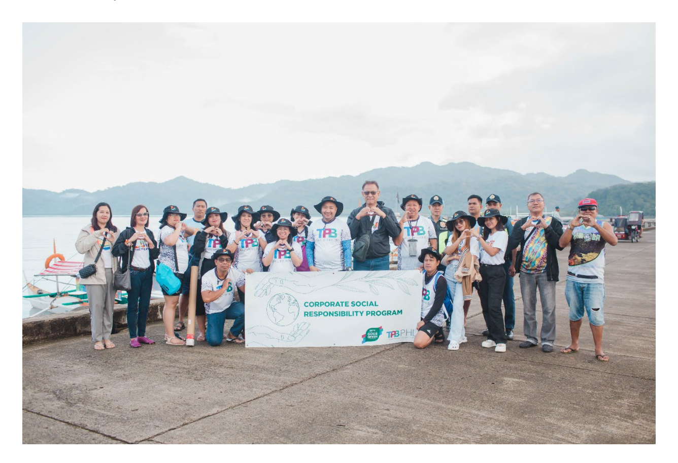
DAY 2: CSR Proper: Turn-over of CSR Goods to the tourist boatmen and students of Palaui Island