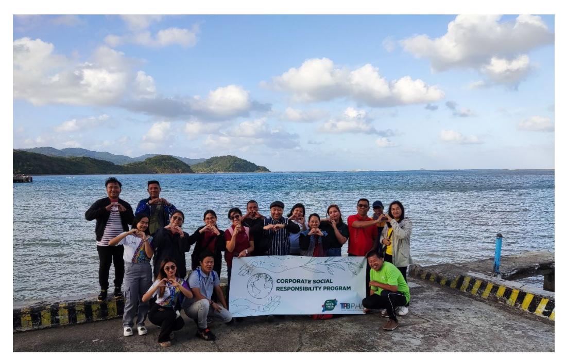
The group at San Vicente Port where the boxes of donations were temporarily stored and the location for the repacking of school supplies