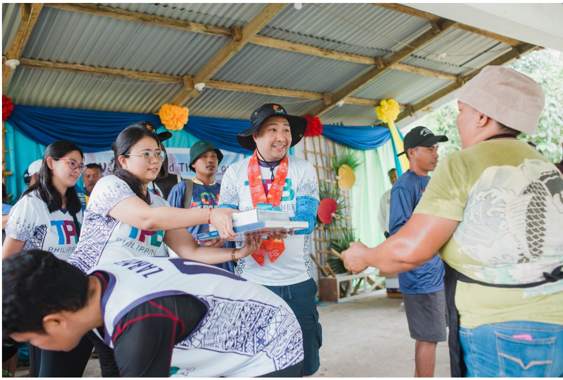
Distribution of the tote bag and solar-powered lamps for the tourist boatmen