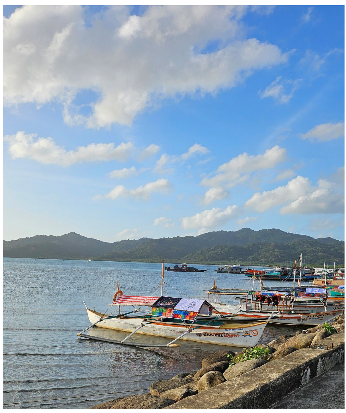
The tourist boats with the newly installed roof covers as donated by TPB