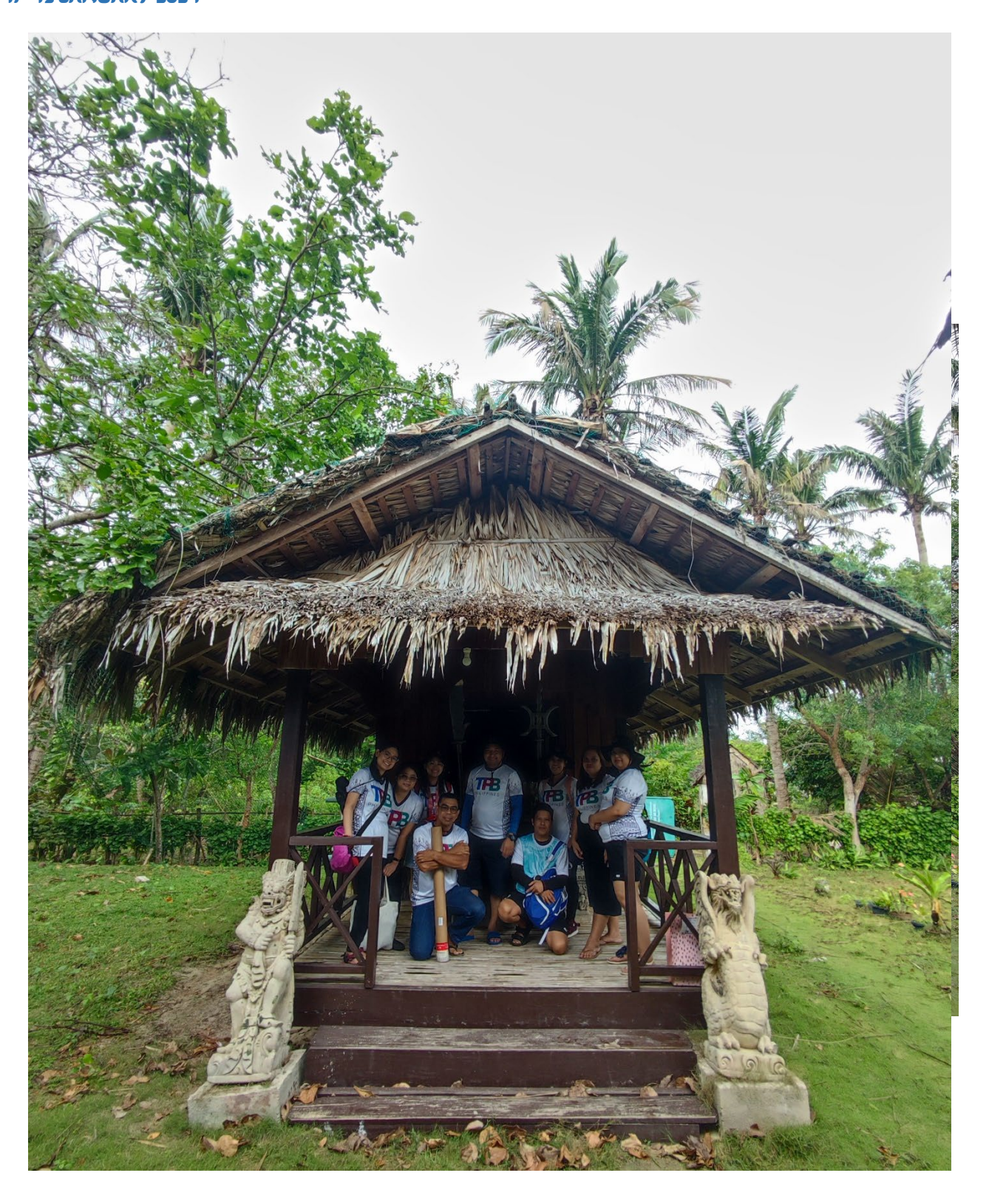
At the eviction hut of the American adventure reality show, "Survivor" in Palaui Island.