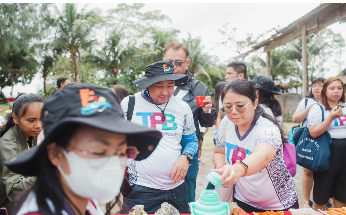
The Palaui Women's Catering prepared some delicacies for the group to enjoy before the start of the program