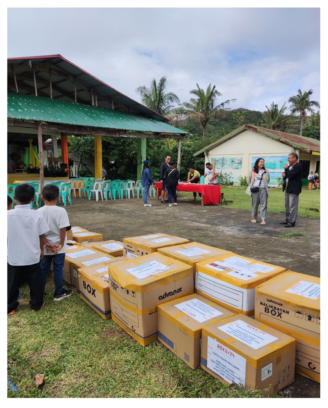
Unloading the boxes of CSR Goods for the students and tourist boatmen.