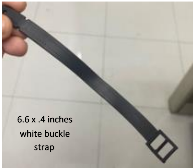
6.6 x .4 inches white buckle strap